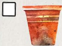
A PLANT POT