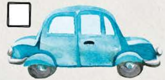
A BLUE CAR