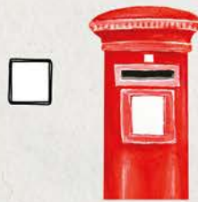
A POST BOX